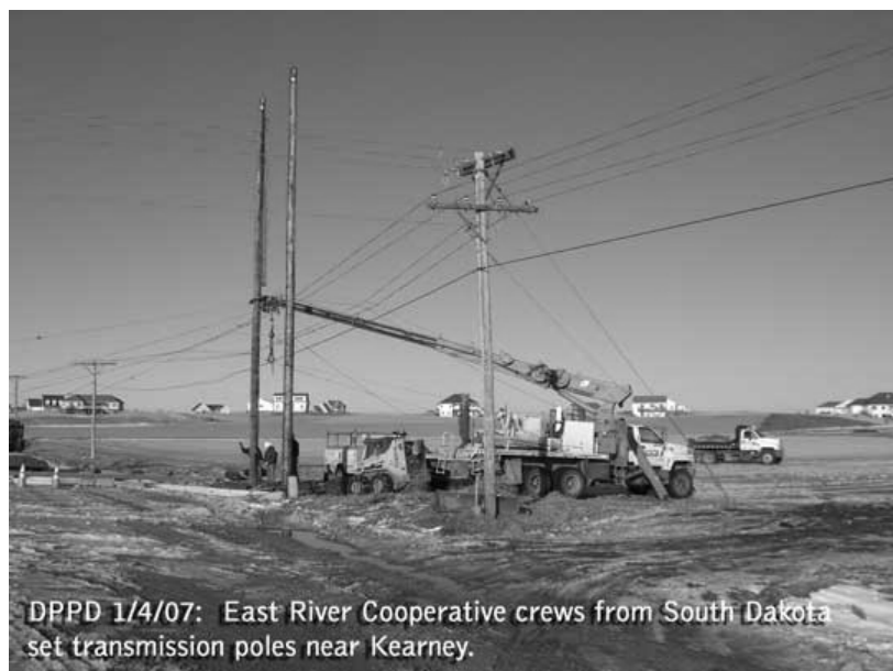
DPPD 1/4/07: East River Cooperative crews from South Dakota set transmission poles near Kearney.